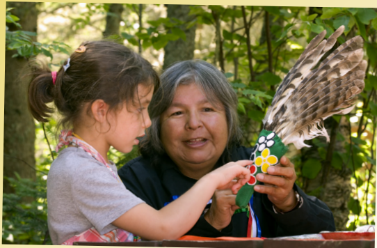
Pukaskwa National Park of Canada.